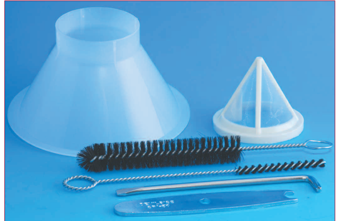
Kit contents are spray gun c/w selected air cap and tip set up, gravity cup, pouring funnel, spanner, torx key and cleaning brushes.

SRi HD Gravity Fluid Tip/ Needle (mm) sizes and code: 0.8, 1.0, 1.2, 1.4