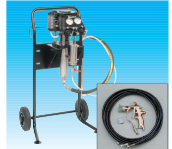
MX 12/31 12 litre per minute high volume pump