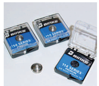
Premium, fine finish and twist tip range available