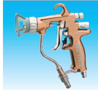
A4400M spray gun. Part no: 0909-4400-HF0000

Five year warranty on workmanship and materials on all Binks MX pumps