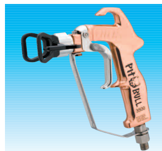
A3500 spray gun. Part no: 1108-3500-2